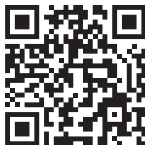
Third party voice control